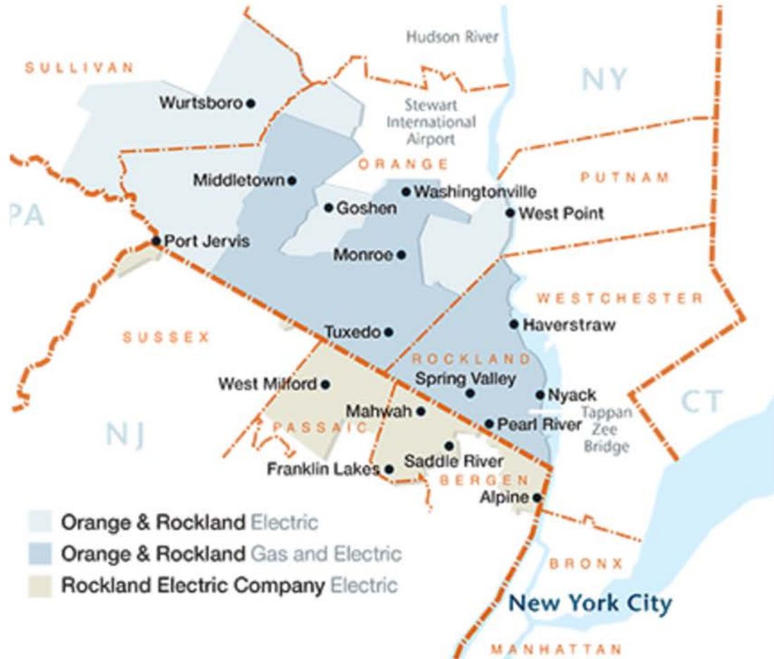
Orange & Rockland Service Territory Our service area Orange & Rockland Service Territory Map showing New York and New Jersey counties where we offer service.