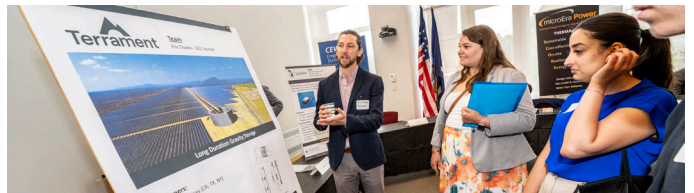
Exhibit for startup companies to demonstrate their technologies, projects, and research.