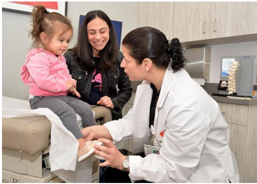
Engineering-driven medicine can enhance hands-on patient care.