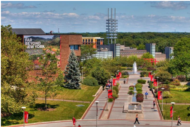
Stony Brook University Campus