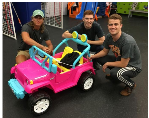
Mechanical Engineering students with modified toy car