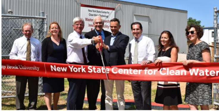
Local legislators, members of the New York State Center for Clean Water Technology at SBU, and SBU leadership were on hand for the ribbon cutting celebration July 9.