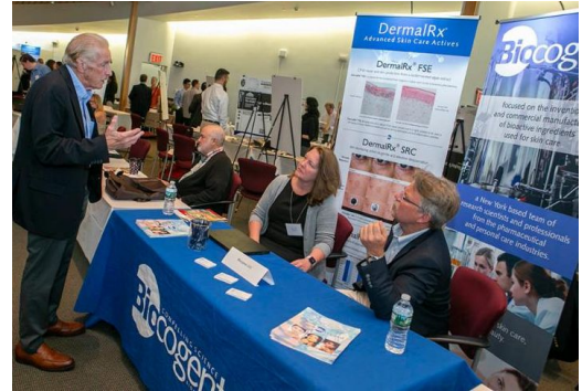
Biotech exhibitors at Incubator Showcase

annual Incubator Showcase, sponsored by the Vice President for Research and the Office of Economic Development , and held at the Center of Excellence in Wireless and Information Technology ( CEWIT ) on June 5.