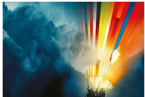
The German film, Balloon, will open the 24th annual Stony Brook Film Festival.

Inkles and co-programmer Kent Marks viewed an almost unbelievable 2,500 entries before determining the 36 films - 20 feature films and 16 shorts - that will be shown at the 24th annual festival, which takes place July 18-27 at the Staller Center's Main Stage Theater. The 10-day event will feature a mix of the best in new independent feature films and shorts, as well as Q&A sessions with many of the filmmakers.