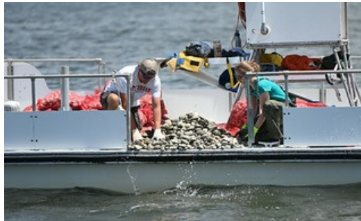
Stony Brook University SoMAS students spread clams and oysters in the Great South Bay