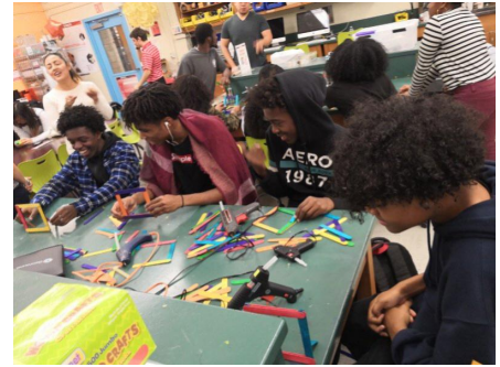
Students made photo frames in the iCREATE Lab.

On Friday, October 19, 2018, twelve high school students and their chaperones from the Boys and Girls Club of the Bellport Area came to campus to learn about Stony Brook and experience college life. The students are sophomores, juniors, and seniors from Bellport High School.