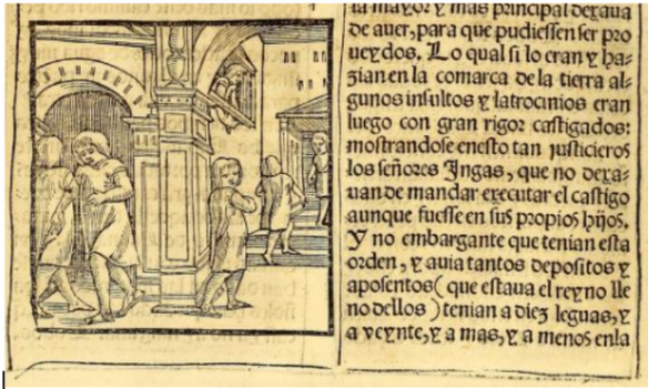
A page section with woodcut from Pedro Cieza de León's Chronicle of Peru , published in Seville in 1553, studied in the journal.