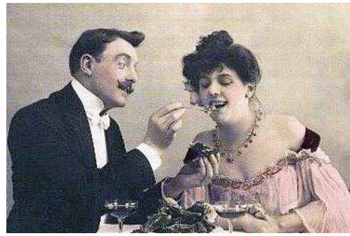
SOUTHAMPTON HISTORICAL MUSEUM

INFO 17 Meeting House Lane; registration recommended, 631-283-2494, southamptonhistory.org ADMISSION Free