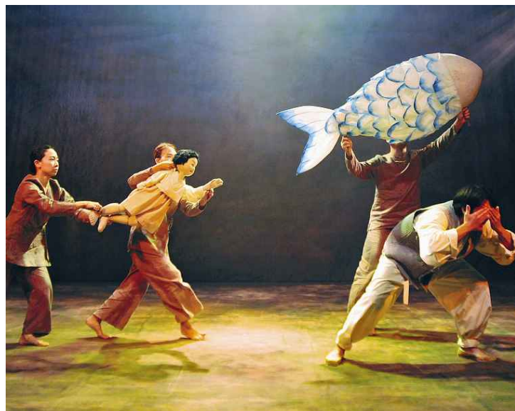
ART STAGE SAN

INFO 631-632-4400, thewangcenter.org ADMISSION $20, (free 5 and younger)